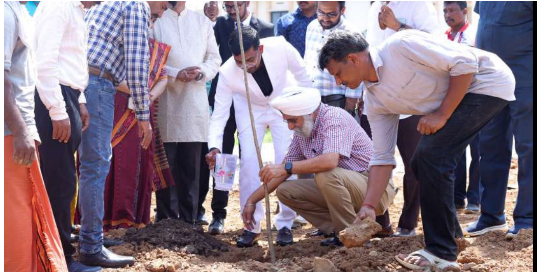
In memory of the visit of the NAAC team, all the three auspicious members planted three sapplings each in our college premises. This would keep the history and memory of this great day alive and will always remind us of the great dreams and achievements the college holds.