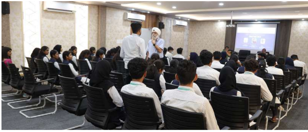
The NAAC team interacted with the students of Nilgiri College. They had a small chat with the students of the Sports Academy and all of them had a great time together as they exchanged great thoughts and insights.